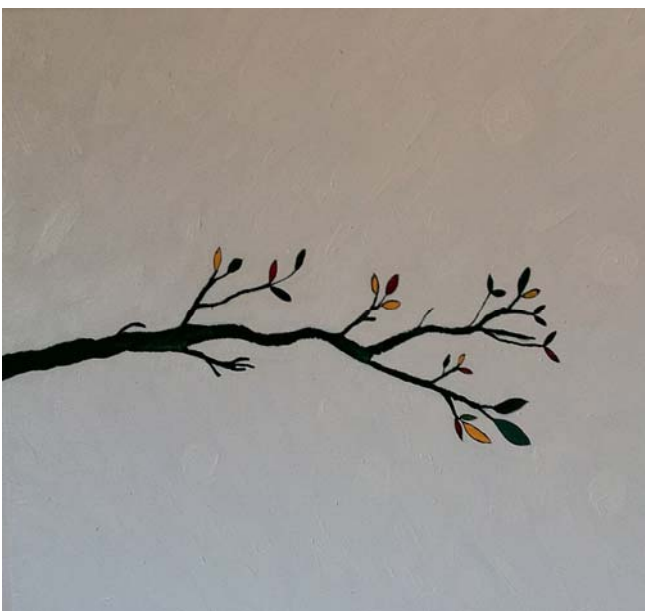
Isabela's spring. 2011. Acrylic on canvas. 61 x 45.5 cm.