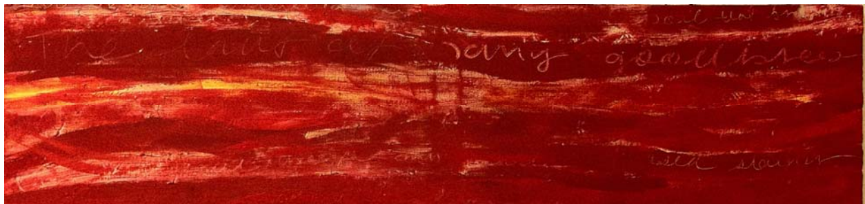
The Lady Sick of Many Goodbyes (Red). 2011. Acrylic on canvas. 114 x 30 cm