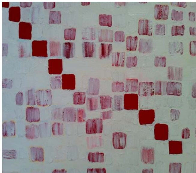
Somewhere in the land. 2011. Acrylic on canvas. 51 x 40 cms.