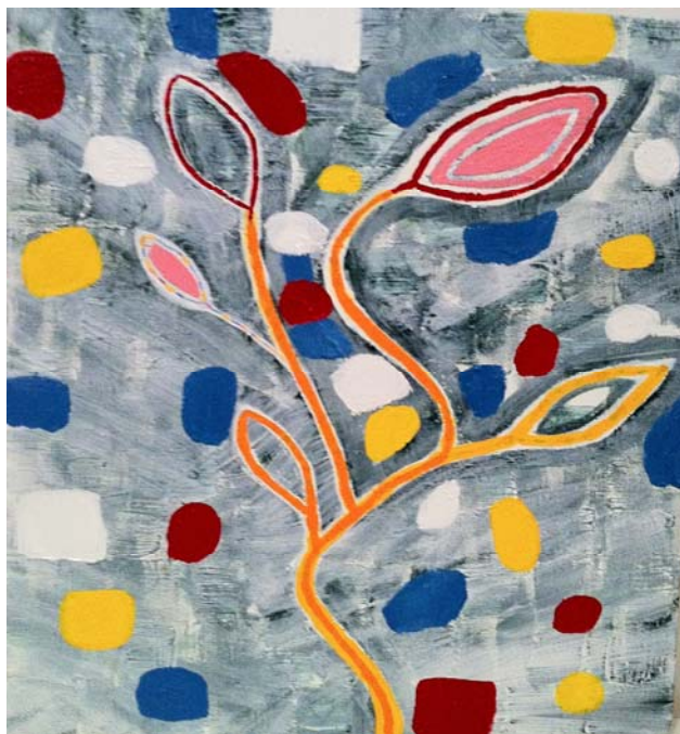
Hope is Verde. 2011. Acrylic on canvas. 51 x 41.5cms.