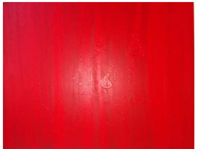
Life matters. 2009. Acrylic on canvas. 61 x 76 cm.