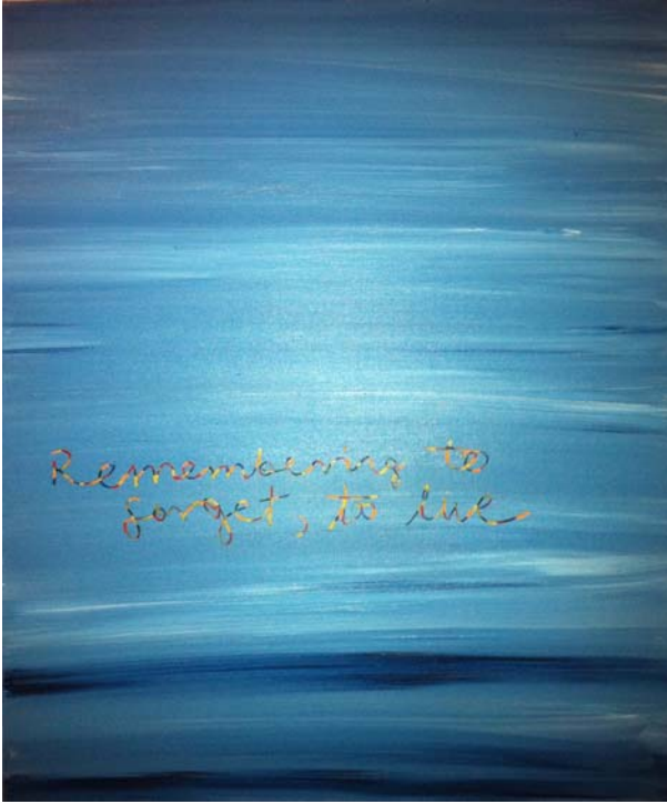
Remembering to forget, to live. 2010. Acrylic on canvas. 61 x 45.5 cms.