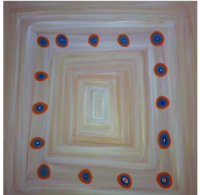
A window to the Unresolved. 2009. Acrylic on canvas. 76 x 76 cms.