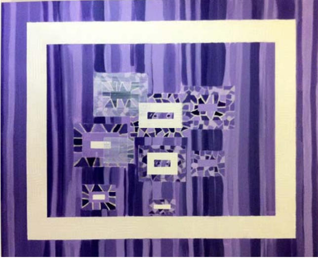
The Disappeared and the Informer. 2010. Acrylic on canvas. 102 x 102 cms.